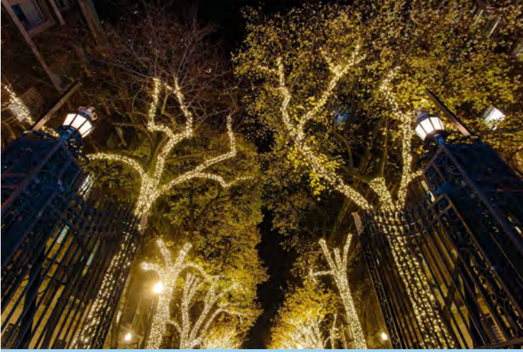
Tree lighting on College Walk

As you prepare for this year's holiday season, here are some helpful tips to ensure a happy and safe holiday season: